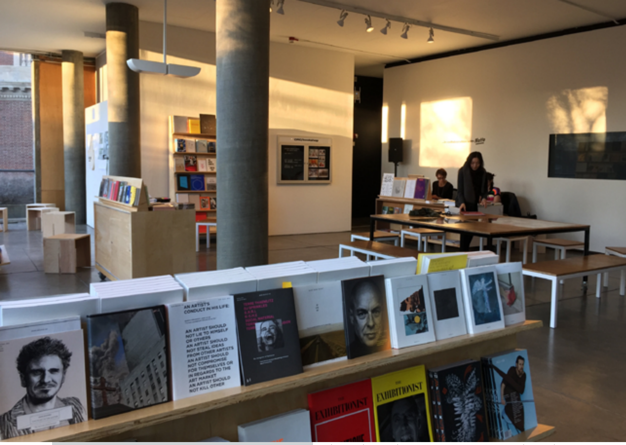
fig.4 Consumer Research Center/Bookshop, 2016, Carpenter Center for the Visual Arts, Harvard University

a decade to become associated with a complex set of overlapping concerns of cultural production, knowledge