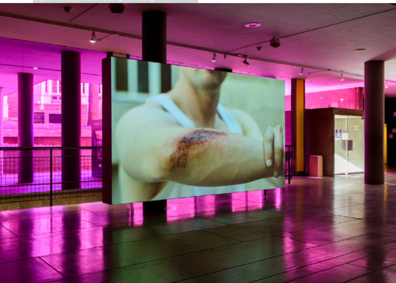
fig.6 caption fehlt / Bildauflösung zu niedrig !